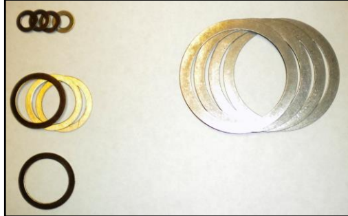
2008-19 QRS Shim Kit 121-211